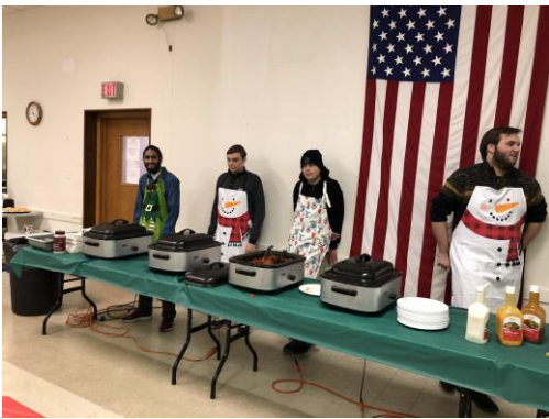
Left: Police officers serving the spaghetti for the Shop with a Copy fundraiser.