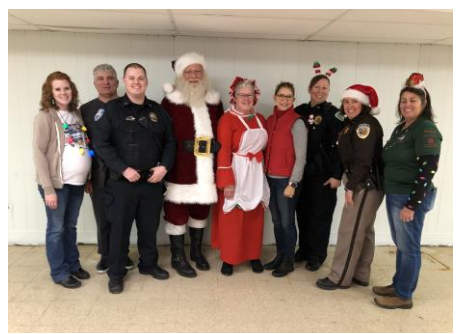
Santa and Mrs. Claus joined the group for a picture