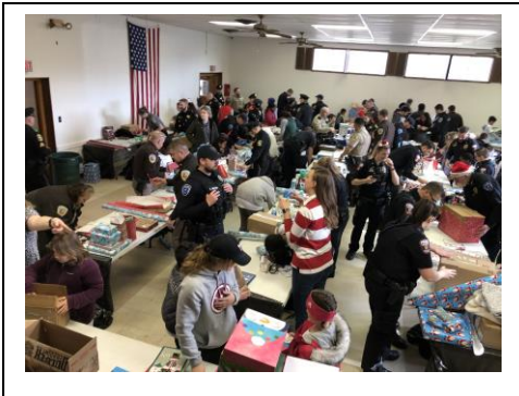
Police Officers, Sheriffs Deputy's and kids wrapping presents in Father Henry Hall after they went shopping at Target.