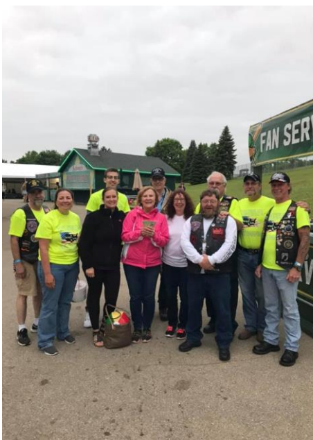
Left: Rolling Thunder members attend Mallard's game in 2019.