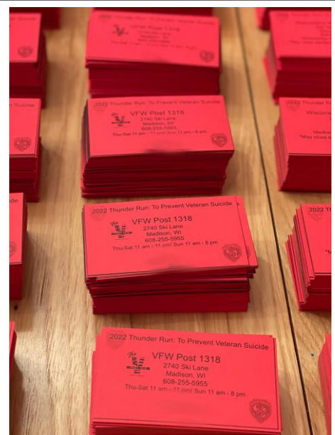
Right: Tickets for the Thunder Run.