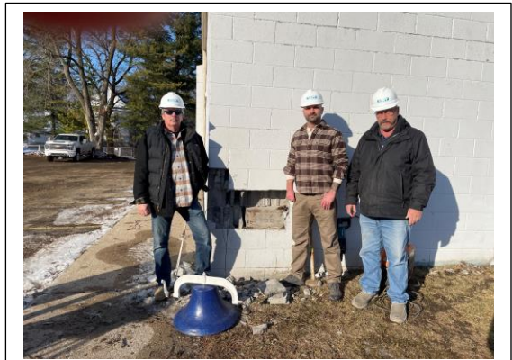
Items from 1969 were placed into the time capsule. That was three years after the building was built.