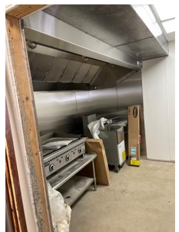
Grill, deep fryers and hood for bar