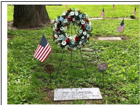
Roger Boekers marker at Forest Hill

HAVE YOU MOVED RECENTLY Please notify the Post if you have moved or have a new email address so that we can keep you informed and plugged into Post Activities