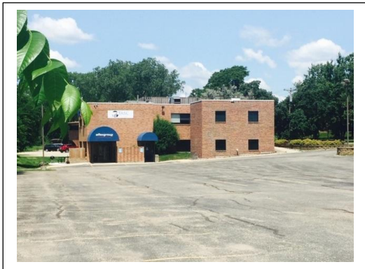
Post future home 2740 Ski Lane, Madison