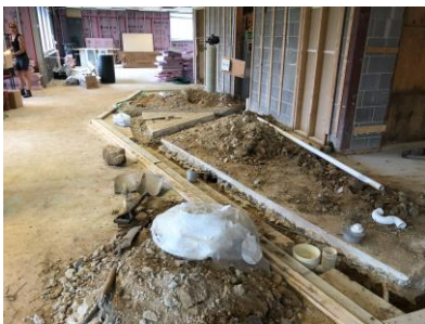
Plumbing for the new bar