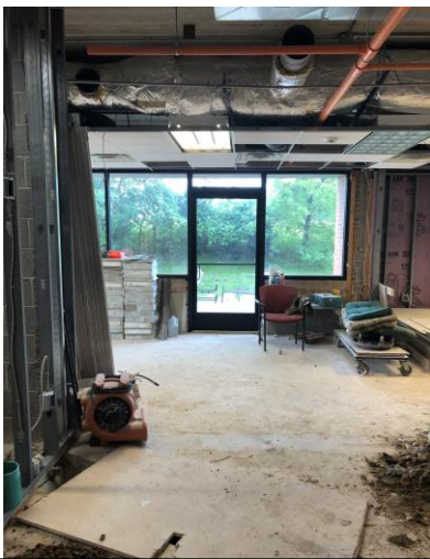
Sprinkler system and patio door