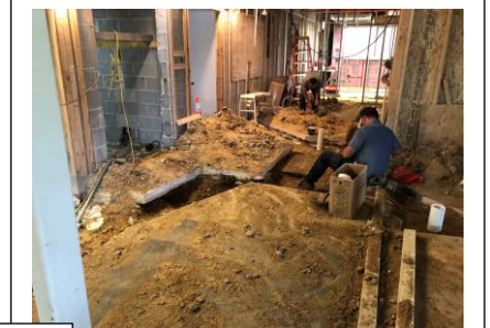
Grease trap for kitchen area