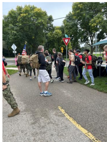
Left: Participants stopping at the Auxiliary table for refreshments