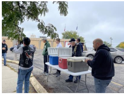
Left: Rolling Thunder table at the Elks Club for Ruck 22.