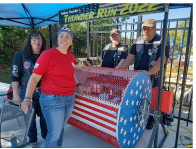
Left: Members of Rolling Thunder preparing to draw names of the winners. Right: People waiting to see if they won from participating in the Thunder Run.