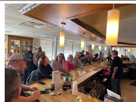
Center and right pictures from the Meat Raffle