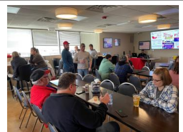
Left: Pancake breakfast participants. Center & right Chili Cook off