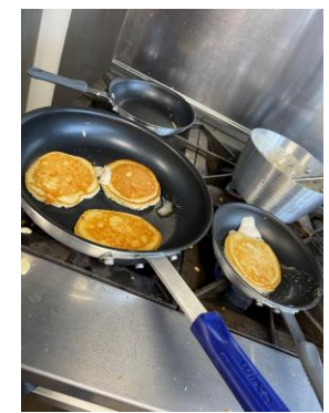
Left & center are pictures of the Great Sing Off. Right: Pancake Breakfast