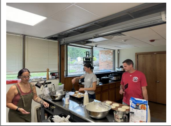
Members of the 115 th Fighter Family Support Group working at a pancake breakfast.