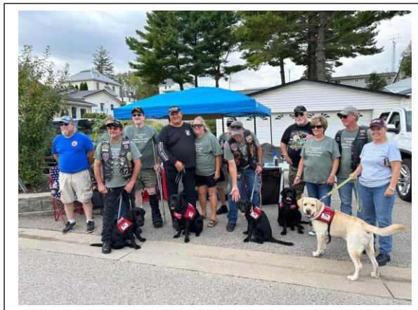
Chapter members with service dogs from Custom Canine Services at the Thunder Run