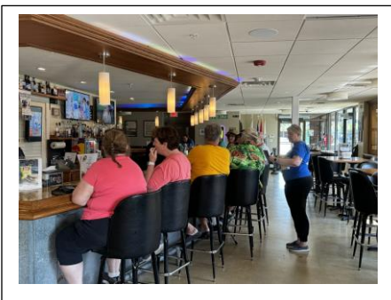
Customers attending an event at the Post and winning the 50/50 Raffle