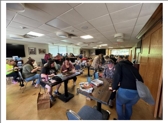
Left: Picture from our Puzzle Challenge Right: Second Place Winner of the Puzzle Challenge.