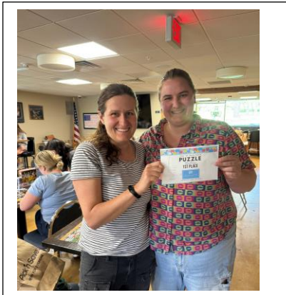
Left: First Place Winner of the Puzzle Challenge. Right: Second Place Winner of the Puzzle Challenge.