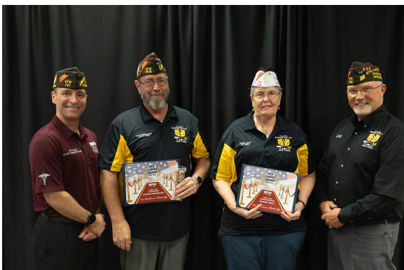
Post Commander and Quartermaster receiving the Red-Carpet Award.