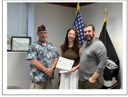
2026 Post Patriot Pens Winners